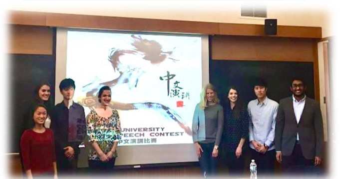
Chinese Speech Contest

For questions regarding the Chinese Language Program or Chinese language courses in general, please visit the website: http://ealac.columbia.edu/language-programs/Chinese/ Or contact Prof. Lening Liu at ll172@columbia.edu