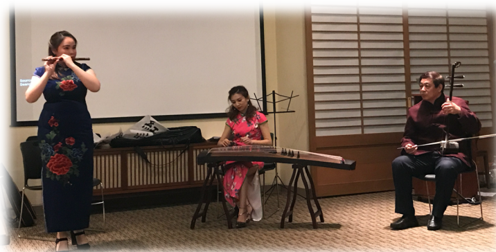
Chinese Traditional Music Ensemble